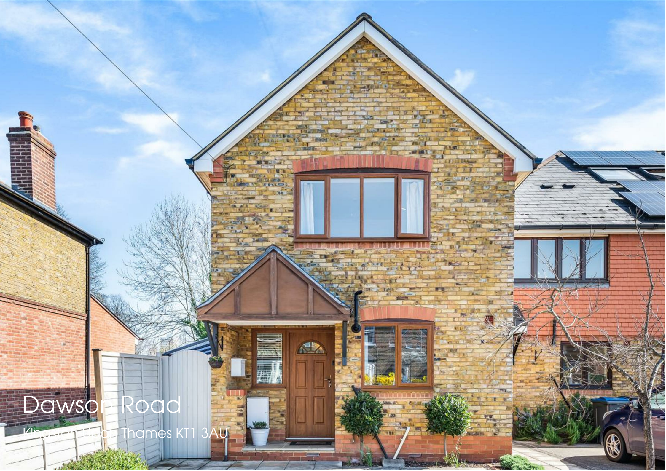
Dawson Road Kingston upon Thames KT1 3AU

34 Richmond Road Kingston upon Thames Surrey KT12 5ED www.gibsonlane.co.uk Tel: 020 8546 5444